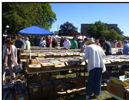
The 2013 Better Book Sale was well-attended thanks to the beautiful weather and the availability of a large selection of gently used books and media.

Saturday, September 20, between 9 and 4 p.m. is a great time for book lovers to find a range of better quality books and media while they enjoy the Gazebo Art Festival and Al Sears Jazz Festival in Chandler Park. Many new good condition donations have come in since the Heritage Days book sale including a large like-new collection of mysteries and action/adventure novels along with over 250 CDs. The sale includes other subject areas such as: fiction, the classics, science fiction/fantasy/horror, history and biography, religion and philosophy, wellness (psychology, health humor, etc.), cook books, nonfiction, as well as children and youth