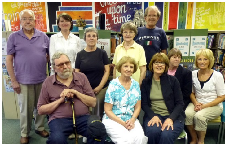
2013-2014 FOMPL Board Members