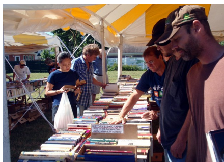
Eager shoppers peruse the selections at the 2012 Heritage Days sale.

We're excited about this year's ever-popular book sale! To better protect us from potential weather threats, thousands of books will be housed under two large tents, plus four smaller tents with media sold in the adjacent Library Annex, 109 E. Jefferson Street. We will start with a Members Only Half Price Sale on Thursday, June 27 from 4 to 6 pm, and end Saturday with a Bag Sale from 3 to 4 pm. Please spread the word, bring friends and relatives and check out the buys.