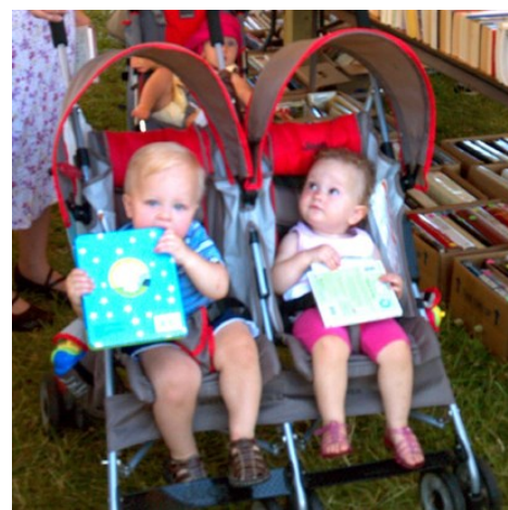
Our books are good enough to eat!